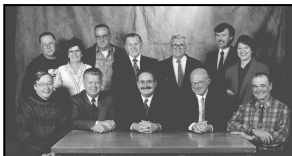
One of the first Barn Dance Historical Society's Board of Directors' Board of Directors. A lot of familiar faces. See if you can pick them out.