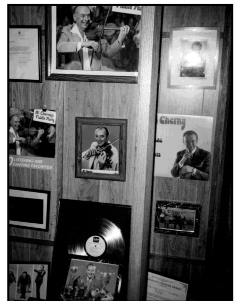
A display case of awards, pictures and albums, by the late Barn Dance Historical Society continues to find a favourable new location, as the current museum is shut down.