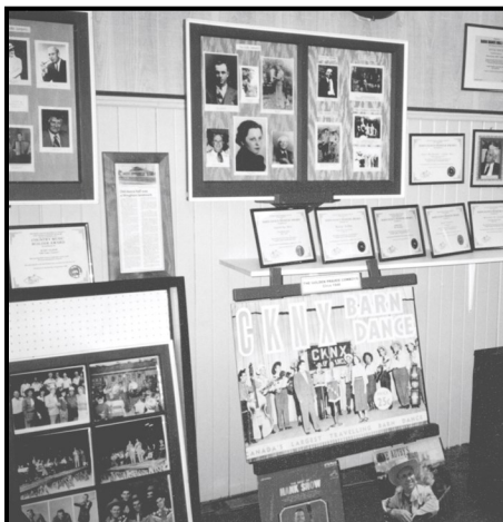
A display of awards and pictures at the first location of the Barn Dance Museum, in the armories upstairs, in Wingham.